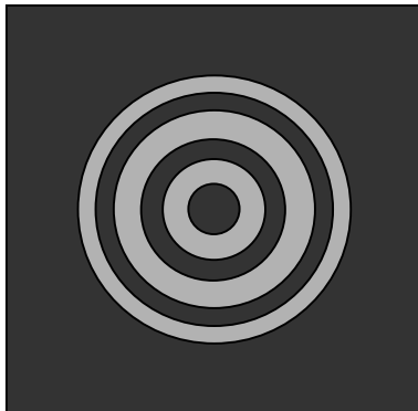
Figure 3. Star pattern of collimated scope.

At this point your scope will probably be out of collimation (Figure 2). Now tighten and loosen appropriate Knobs until the mirrors and their reflections are once again concentric (Figure 1), and the secondary mirror is held securely. If a Knob becomes hard to turn, loosen the opposite Knobs slightly. Check your owner's manual for additional guidance for your particular scope.