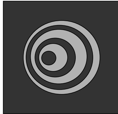
Figure 4. Star pattern of uncollimated scope.